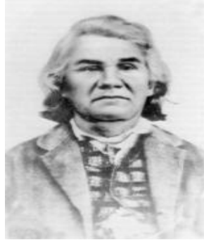
Confederate Gen. Stand Watie of The Cherokee Nation

When the War Between the States ended, the women of the North and South formed memorial organizations. They made sure that the soldiers got a Christian burial and were remembered. Great Monuments were erected to the soldiers of Blue and Gray that still can be seen in many town squares and soldiers cemeteries.