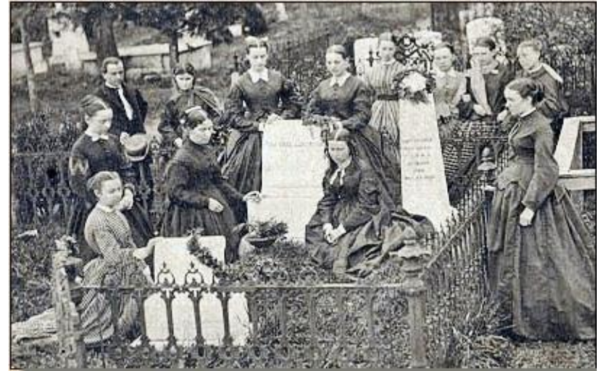
Ladies of the South Care For graves of Confederate Dead

What is your state, county or city planning to remember our Southern ancestors during April--Confederate History Month? Let us here from you, today, and throughout the month of April. Get your whole family involved in remembering the wonderful Heritage of Dixieland.